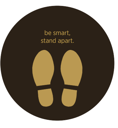
Ensure that you keep a safe distance of at least 1.5m apart.