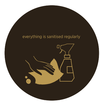
All surfaces, facilities and rooms will be sanitised and thoroughly cleaned on a regular basis.