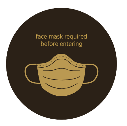
Face masks are to be worn by Guests and Team members in the public areas at all times.