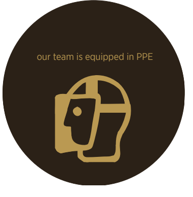
Team members will be equipped with the necessary PPE to provide the best service throughout your Lanzerac experience.

The Lanzerac health and safety regulations are 'Stellenbosch Ready' compliant.