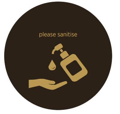
All Guests and Team members are required to sanitise frequently and sanitation stations are available throughout the Estate.