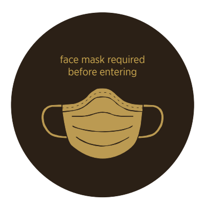
Face masks are to be worn by Guests and Team members in the public areas at all times.