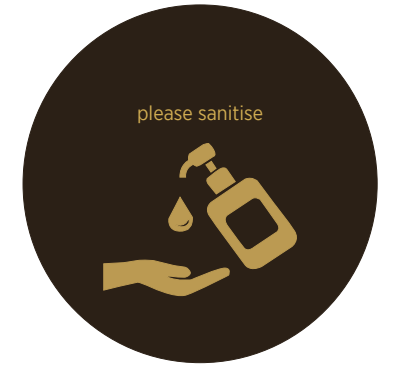
All Guests and Team members are required to sanitise frequently and sanitation stations are available throughout the Estate.