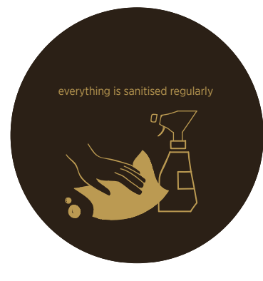
All surfaces, facilities and rooms will be sanitised and thoroughly cleaned on a regular basis.