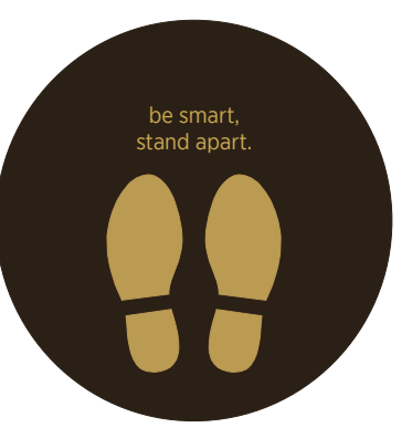
Ensure that you keep a safe distance of at least 1.5m apart.